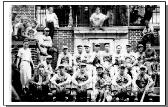
The St. Louis Cardinals and local children in front of the YMCA building on High Street, Metuchen, July 1936.

The Metuchen-Edison Historical Society was founded in 1974 with the primary purpose of promoting an interest in and appreciation of the history of the Borough of Metuchen and of Edison Township.