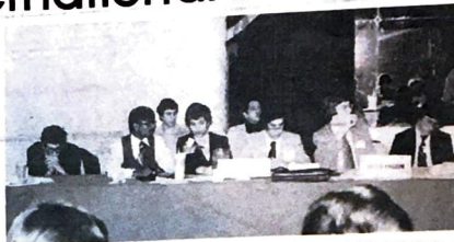
A tense moment at the National High School Model United Nations.

The National High School Model United Nations consisted of a Security Council with delegations representing about 15 nations, and the General Assembly, with 135 delegations as well as some "observed nations," such as North and South Korea, Holy See, Switzerland and the Palestine Liberation Organization, who are not members of the U.S., but send delegates to observe the proceedings. The Security Council deals mainly with political issues, while the General Assembly deals with world problems—social, economic,