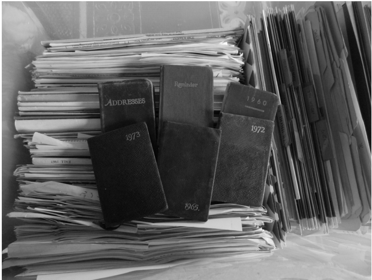
Files, date books, address books, and documents.