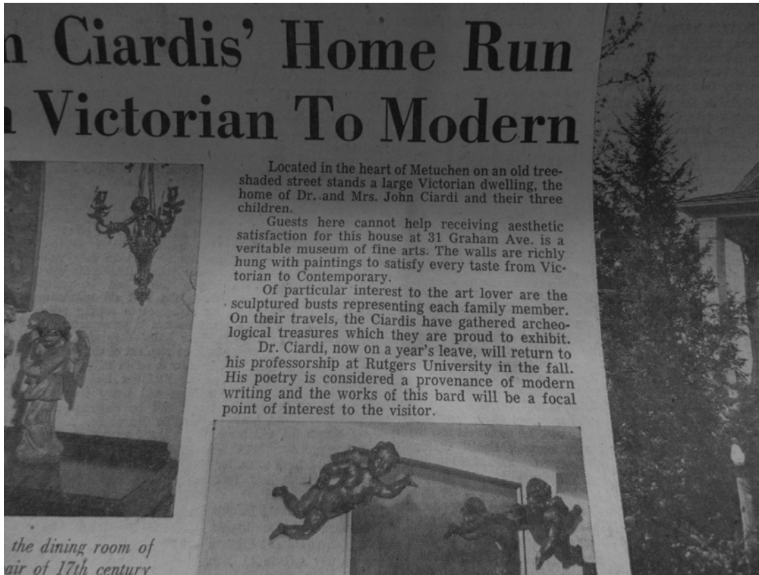
Newspaper article detail.