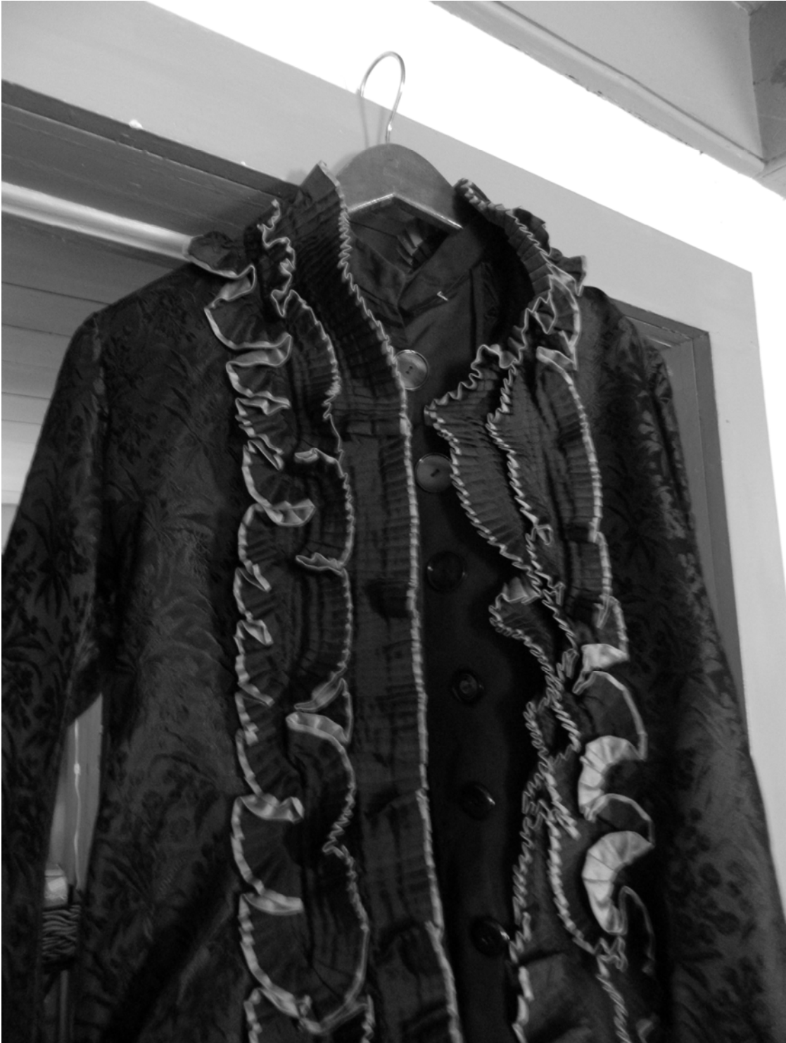
Portion of an antique dress.